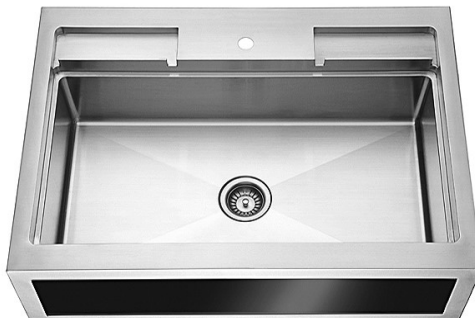
DAFF3026G, DAFF3326G, DAFF3626G

These instructions are for installing Dawn apron front sinks. Please read all instructions carefully before starting the installation.