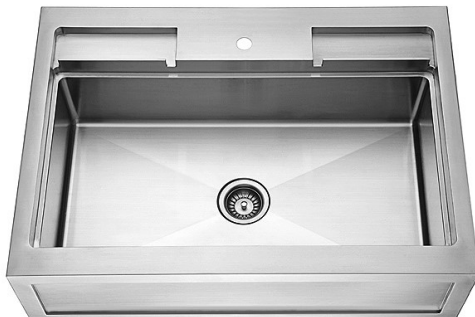
DAFF3026, DAFF3326, DAFF3626

MODELS: DAFF3026, DAFF3026G, DAFF3326, DAFF3326G, DAFF3626, DAFF3626G,